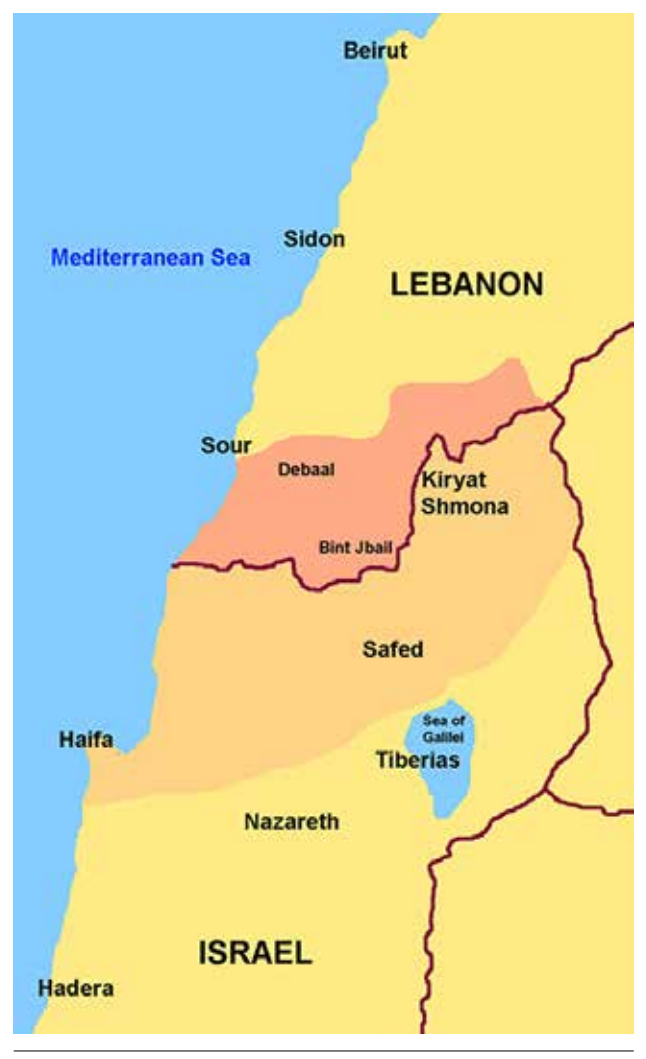
Figure 1. International borders are marked in brown lines. The region of conflict designated as high combat exposure is marked in light red, while the region of conflict designated as low combat exposure is marked in light orange

border between Israel and Lebanon, combat exposure was determined high if a soldier crossed the international border into Lebanon as part of active combat maneuver (see Figure 1). Alternatively, combat exposure was determined low if a soldier was deployed in the Northern Command but remained on the Israeli side of the international border throughout the war. Soldiers in the high exposure group typically engaged in direct combat in addition to having to endure mortar and rocket fire. Soldiers in the low exposure group were exposed to mortar and rocket fire only. To validate this geo-operational index of combat exposure we measured the percent of soldiers killed and the percent of soldiers wounded during the war in the high- and low-exposure groups. These